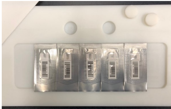
FIGURE 1: B3 dosimeters spaced edge to edge