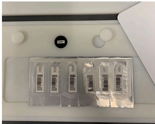
FIGURE 2: B3 dosimeters overlapping edges (with alanine dosimeter)